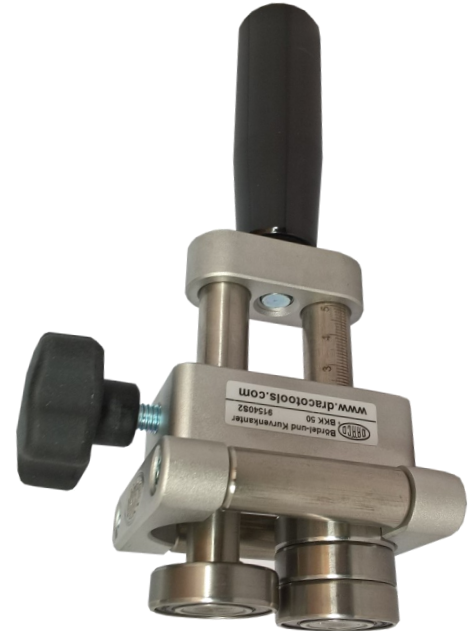
BKK 50 S2, with one upper roller