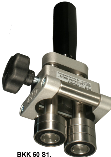
BKK 50 S1, with two upper rollers